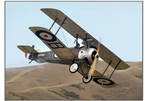
A replica Sopwith Camel in flight

Project Lead the Way: Engineering students and Auto Tech students from Fort Mill and Nation Ford High Schools have begun a yearlong project to build a full sized Sopwith Camel bi-plane.