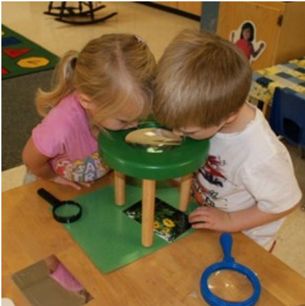
Students use a tripod magnifier to explore the characteristics of sunflowers.