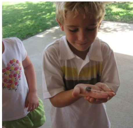
A student observes a caterpillar collected on our playground.