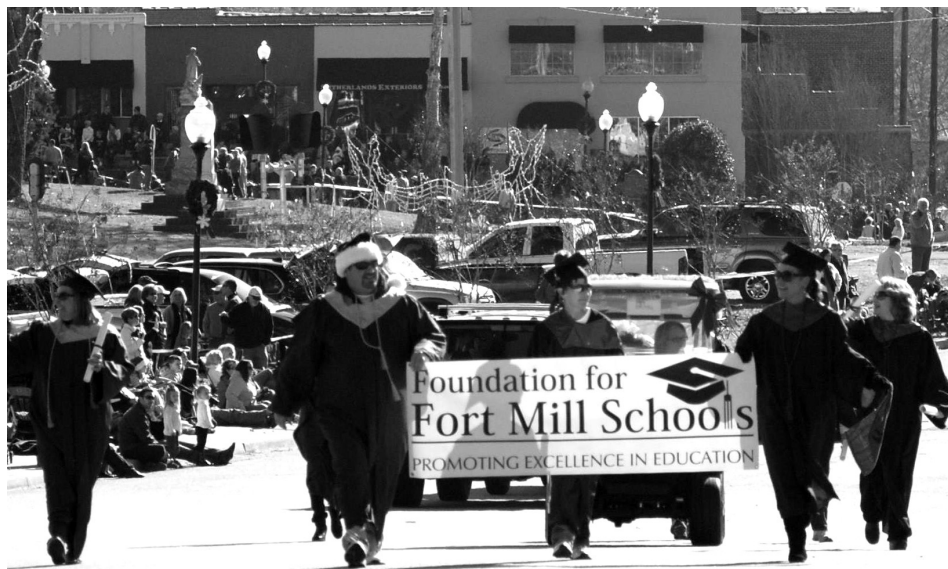
Foundation board members enjoy the 2011 Fort Mill Christmas Parade.

“Honor a Teacher” is a fundraising program for the Foundation for Fort Mill Schools; all contributions received through this program go directly to the Foundation.