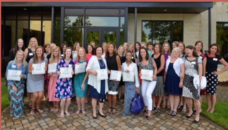
2015-2016 Grant Winners